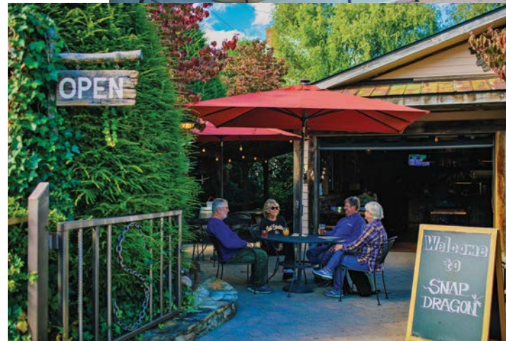
TOP TO BOTTOM: Appalachian Java; one of the many eateries downtown; sunset